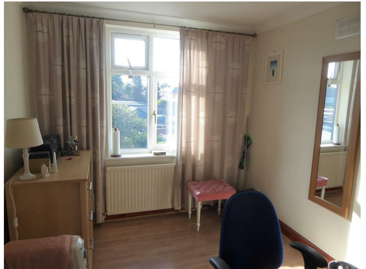
Rear aspect double glazed window, radiator, wash hand basin.