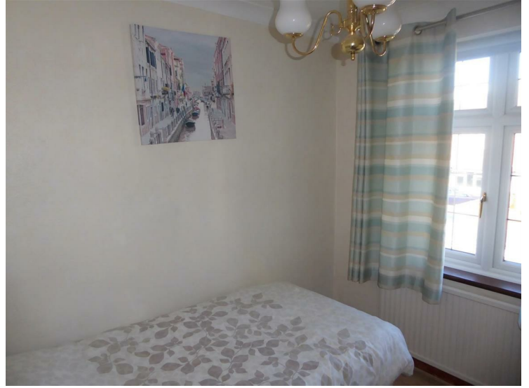
Front aspect double glazed window, radiator, power point.