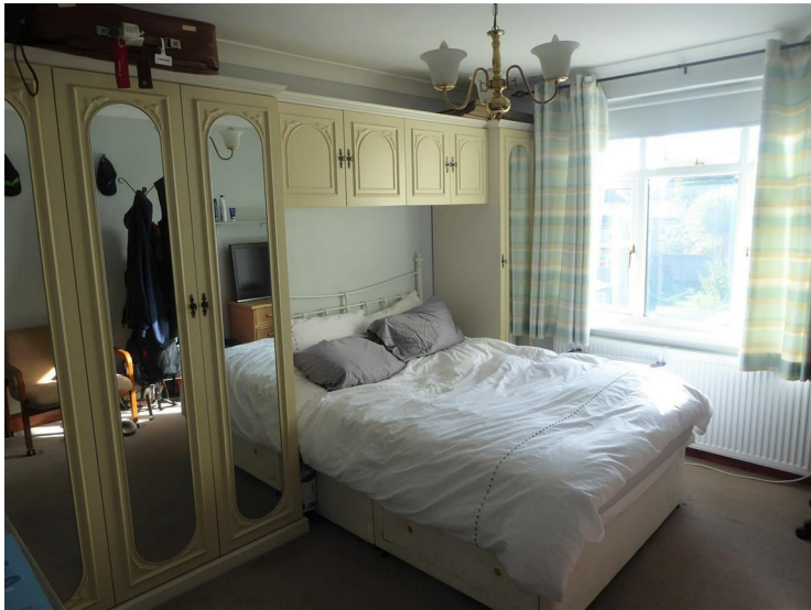
Rear aspect double glazed window, radiator, built-in wardrobes with bed recess.