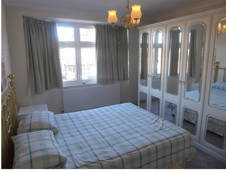
Front aspect double glazed window, radiator, built-in wardrobes.